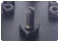
Firm & tunable screw