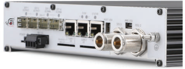
SAQR 7000 IDU modem

Supporting channel bandwidths of up to 60 MHz, the SAQR 7000 enables transition from TDM only or ASI only networks to hybrid native ASI/T1/E1/ IP networks, providing up to 16 ASI ports for video or up to 64E1/T1 lines for telephony, and Gigabit Ethernet ports for IP connectivity with total throughput of up to 900 Mbps in 2+0 configuration.