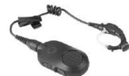
Operations Critical Wireless Earpiece

“When I first saw the MOTOTRBO SL Series I thought that it was a cell phone, not an actual two-way radio. It has all the capabilities of a two-way radio but with a professional, discreet look that fits absolutely well with all our uniforms.”