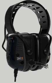
SM1RB001 | HEADBAND 27dB NRR / 33dB SNR / 31dB, Class 5 SLC80