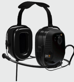
SM1RE001 | BEHIND-THE-NECK 24dB NRR / 30dB SNR / 27dB, Class 5 SLC80