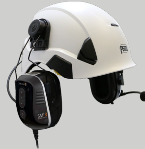
SM1RH001 | HELMET MOUNT 23dB NRR / 31dB SNR / 26dB, Class 5 SLC80